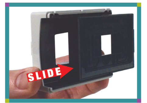
1. Remove impression frame<sup>™</sup> from line dater and slide out impression cartridge from frame as shown.